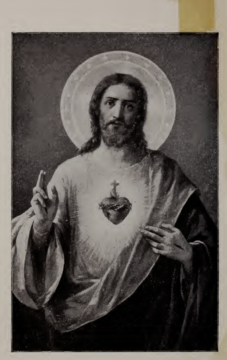
THE SACRED HEART OF JESUS.